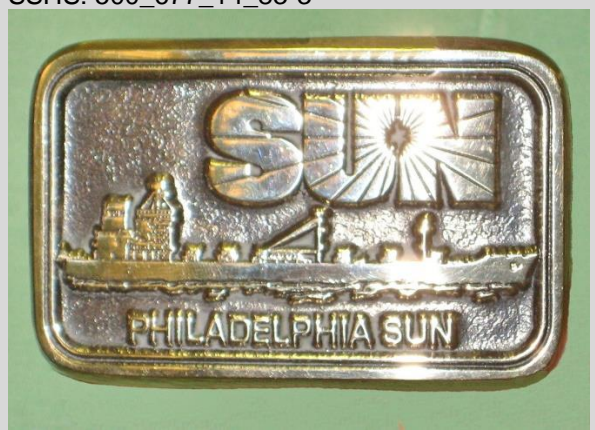
5.8: Ship's 'Belt-Buckle' owner photographed at SSHS-Delaware County Historical Society display c: 2007.10. Note: If anyone can identify this gentleman, we would be very appreciative.