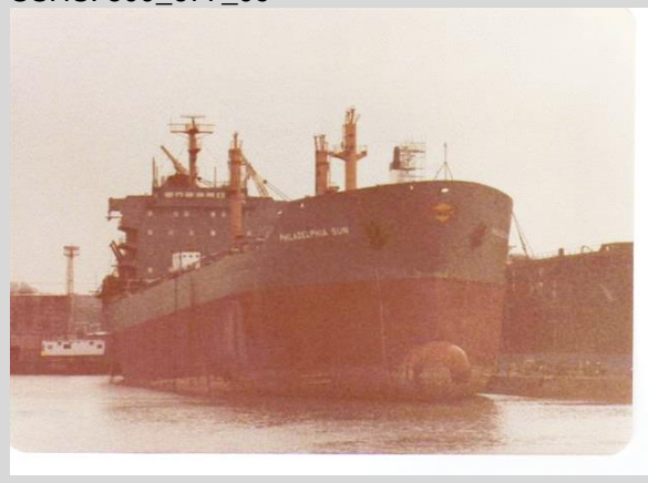
5.4: Ship on Sun Ship's No.4 Dry Dock undergoing final hull work and painting prior to delivery-Forward View 500_677_03a<sup>1</sup>