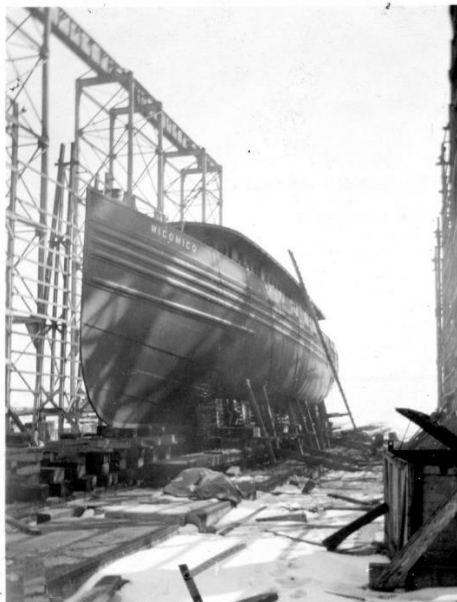
4.3: 454_88_2609_674ra, C: 1926.02