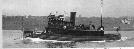
WICOMICO flies two PRR flags steaming on the Hudson River. This tug also served both the NYC and C&O railroads.