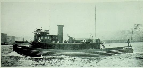
Wicomico tug tow a 324 ft. net boat loaded with 50 freight cars, her main motor developing 525 h.p. at 125 r.p.m.