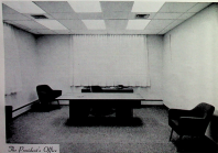
The President's Office

It was a hard decision to make. It was a hard decision to make. It was a hard decision to make. It was a hard decision to make. It was a hard decision to make.