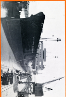
Relocating after successful test, Republic's new 400-ton (36,287 kg) crane is being moved to the deck of the ship's hull by the ship's deck crew.