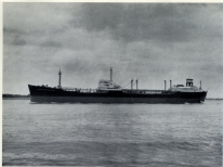
U.S. STEEL CO. TANKER