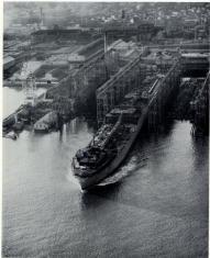
U.S.S. WESTERN SUN—OCTOBER 16, 1954